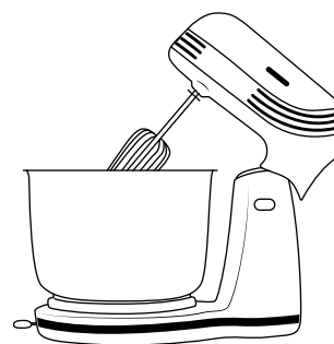
Fig./Img./Abb./Afb./ Rys./Obr. 2